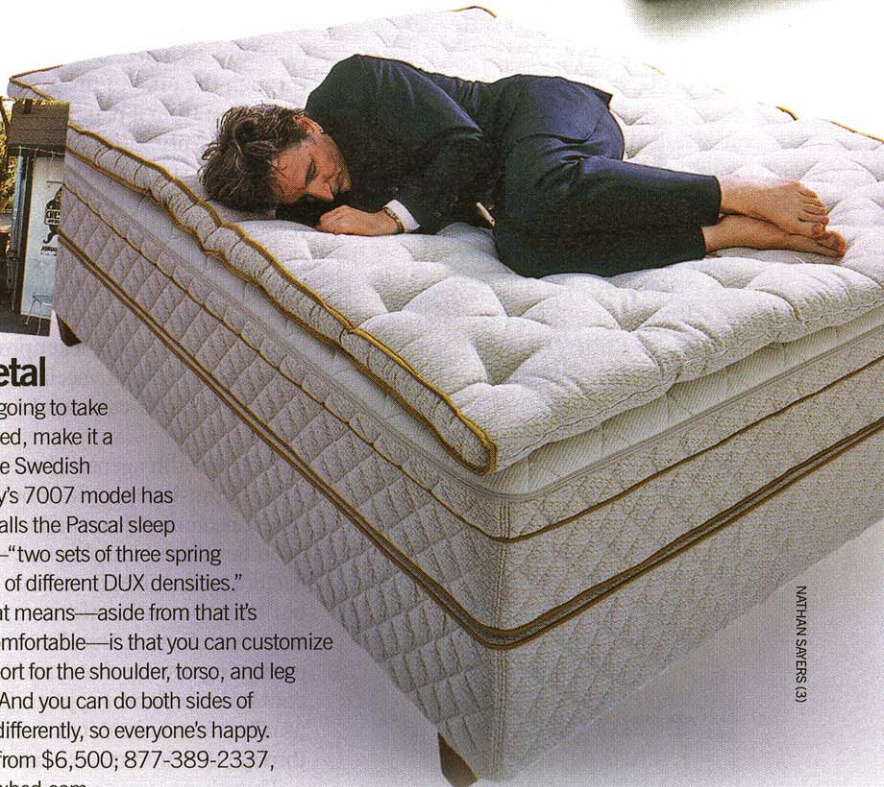
NATHAN SHERS (3)

If you're going to take to your bed, make it a DUX: The Swedish company's 7007 model has what it calls the Pascal sleep system—"two sets of three spring modules of different DUX densities." What that means—aside from that it's super-comfortable—is that you can customize the support for the shoulder, torso, and leg regions. And you can do both sides of the bed differently, so everyone's happy. Queens from $6,500; 877-389-2337, www.duxbed.com